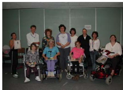
Women with Disabilities Group

They received a grant from the Office of Women's Policy for the "Having Fun and Feeling Good" project. A series of forums were held from January to June 2005 that included information on menopause, belly dancing, laughter yoga, public speaking, make up, and dressing well.