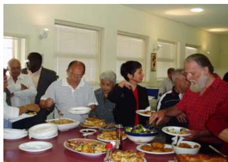
A sumptuous meal was served afterwards