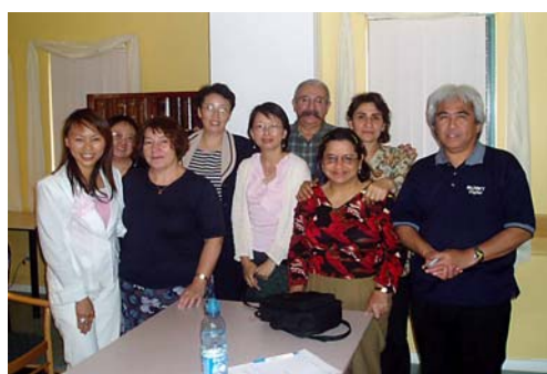
Thornlie TAFE Students

A total of 28 students (from both semesters) graduated from the TAFE Certificate III in Disability Course .