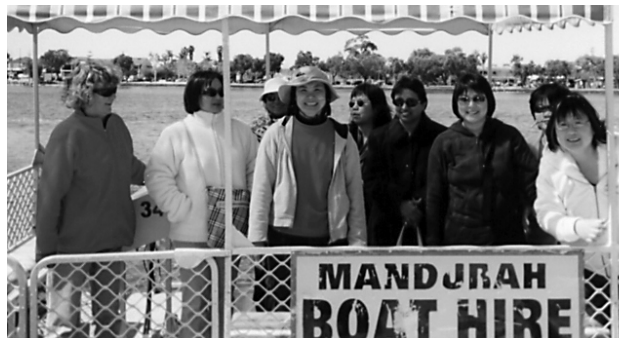
Some families enjoying respite in Mandurah

A group of 12 Carers had a well deserved relaxing respite in Mandurah from September 9 to 11th. The mothers had a great time bonding, sharing, caring and laughing together.